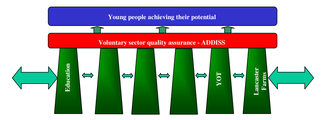
Fig 2. Allied services handshake model

Partner agencies have each produced an individual, mental health specific action plan as part of the DDAP process. Uniquely these plans include three elements, i) what the agency recognises as service improvements, ii) what the agency recognises it needs to higher standard from partners and iii) what the agency can deliver, with the project in mind, to higher standard to partners. As a suite of DDAP development plans these are quality assured by ADDISS, a process that places the voluntary sector at the forefront of the project. The model, referred to as the 'handshake model' is instrumental to the development of true allied services across the participating agencies.